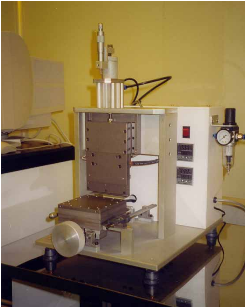
CAT No. 020407K