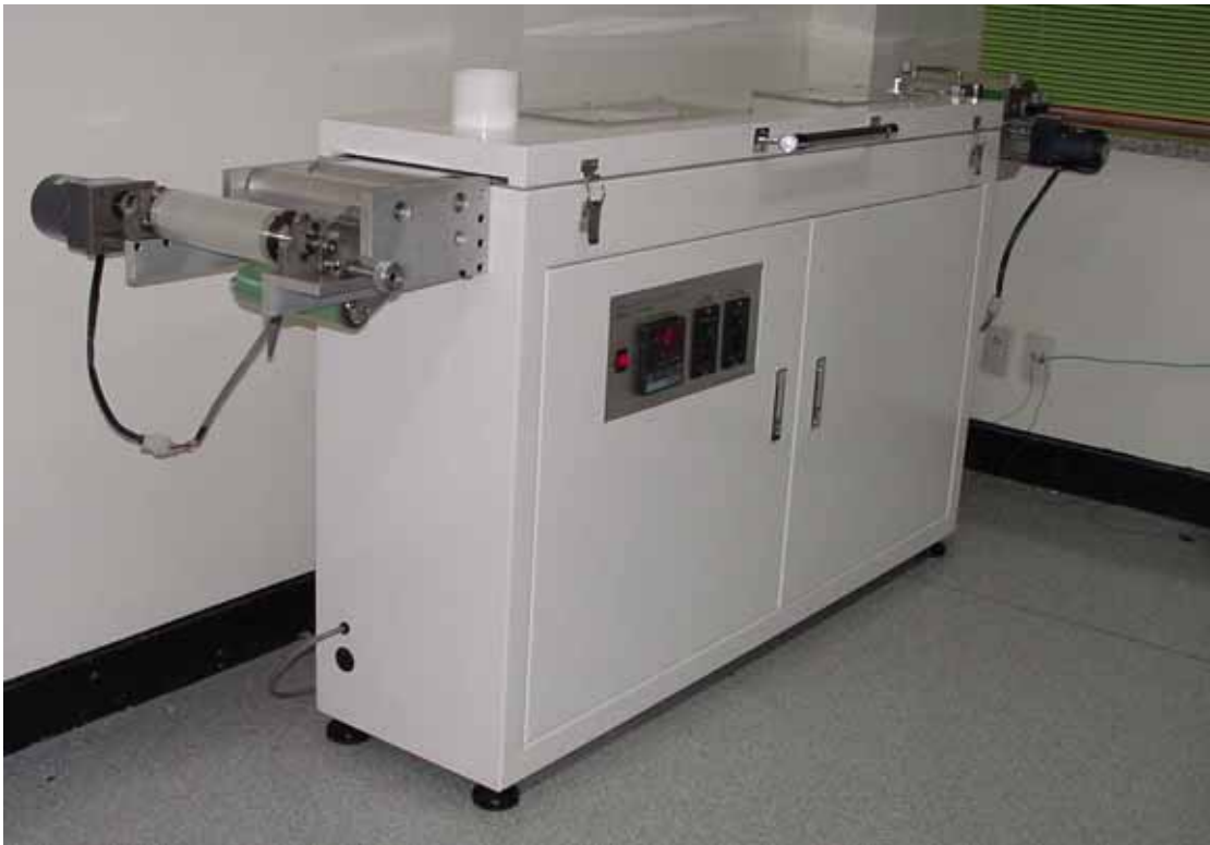
TAPE CASTING MACHINE (Model STC-14A)

Applications : Multi-layer Ceramic Package LTCC Chip-Inductor LCR filter . MLCC 가 , Ceramic , GREEN SHEET