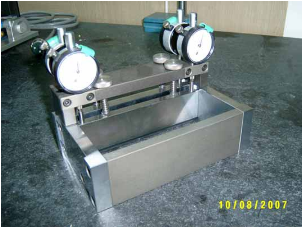
STC-14A Dual Dr. Blade ( / 0.01 mm)