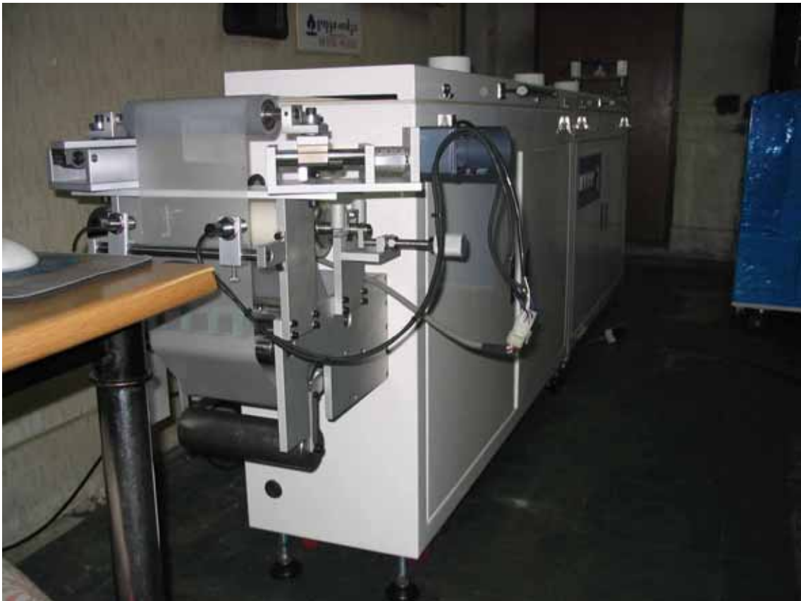
TAPE CASTING MACHINE (Model STC-28A)

Applications : Multi-layer Ceramic Package LTCC Chip-Inductor LCR filter MLCC Ceramic GREEN SHEET